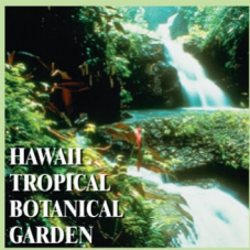
SEE 6 AT I-3